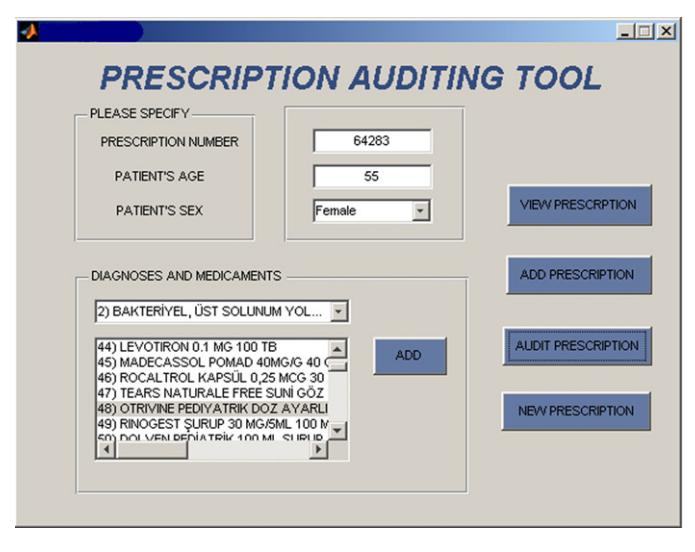
Fig. 3 – Inserting a prescription to the prescription auditing tool.

items in a prescription that could have been legitimate without those.