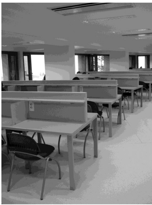
Fig. 2. The new tables with territorial dividers.