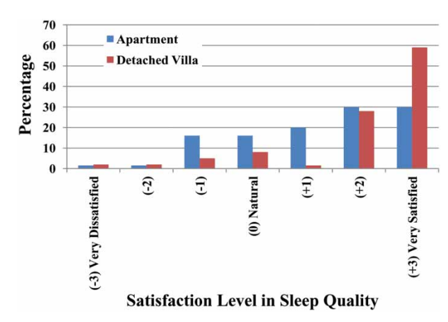
Figure 2. Satisfaction level in sleep quality of occupants among the occupant types.