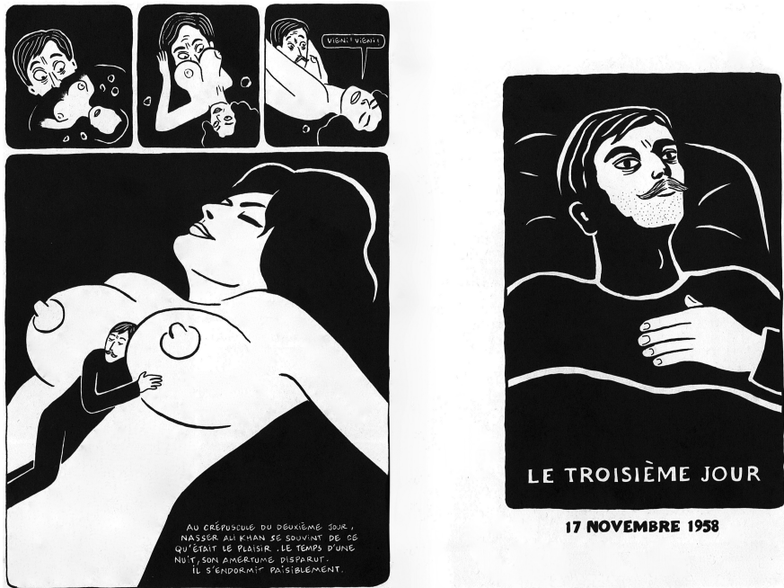
Figure 1 The conclusion of Nasser Ali's Sophia Loren fantasy, and the beginning of Day Three. Reproduced from Poulet aux prunes (2004) by Marjane Satrapi with permission from L'Association.

Ali lies awake in bed with an upturned, smiling face and his left hand draped across his own chest in a gesture that mirrors his caress in the previous panel. His face and body in the header are also angled in a way that mirrors Loren's. However, in contrast to the full clarity given to her imagined, exaggerated body, prominent shadows obscure Nasser Ali's jawline and cast shadows over parts of his nose and brow. Still, the source of his pleasure on this third day is clear, and the panels on the following page resume the action from this point of relatively optimistic perspective.