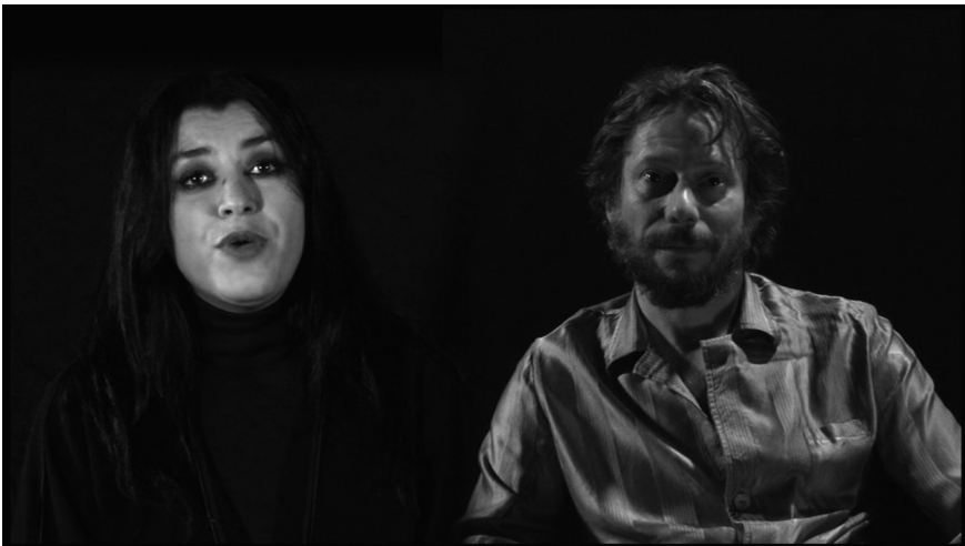
Figure 6 Marjane Satrapi and Mathieu Amalric in the “Conte iranien” featurette of the Poulet aux prunes DVD released in France (Wild Side Video, 2011).

The clearest acknowledgment of Satrapi’s role as purveyor of Iranian cultural knowledge is the ‘ Conte iranien ’, a fifteen-minute soliloquy in which she outlines the diverse sources of inspiration behind Poulet aux prunes . Eschewing nearly every convention of cinematic narration, this featurette has no set, no organising narrative structure, minimal editing, and utilitarian (which is not to say bad ) lighting. The camera never moves. Dressed in black, Satrapi sits screen left and looks directly into the camera as she speaks; sitting screen right is Mathieu Amalric, sporting a full beard and a rumpled grey shirt (neither of which featured in his on-screen wardrobe for the film), his gaze trailing off to one side of the camera (Figure 6). On screen, the viewer sees Satrapi and Amalric together, although each was evidently filmed with a different camera and joined in post-production. At the beginning and end of her discourse, Satrapi directly addresses Amalric as Nasser Ali, although he does not speak until the very end. This spare setup, visually unappealing in itself, practically demands that its viewers relinquish