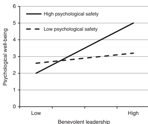
Figure 2. Interactive effects of benevolent leadership and psychological safety on psychological well-being

The results in this study suggest that researchers should continue to investigate psychosocial and contextual factors such as person-job fit (Vigoda-Gadot and Meiri, 2007), organization structure and size (Perry et al. , 1994), organizational politics (Davis and