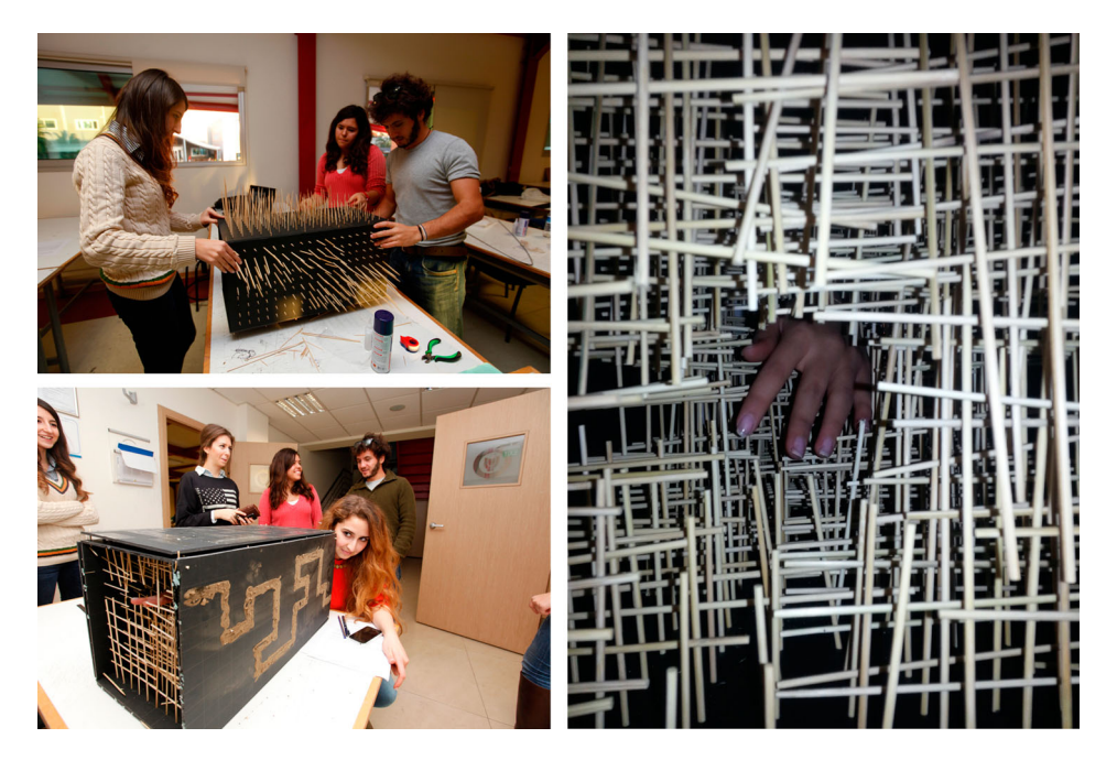
Figure 3. 'A Box of Experience' (Image courtesy of authors, 2013).

The third project was called 'A Box of Experience'. This group offered different experiences to participants using 'the box'. It was constructed of cardboard shot through with thin wooden sticks, which formed a 3D labyrinth inside. The participant would try to reach the end of the box with his or her arm, passing along the sharp points of the sticks that formed the edges/contours of the interior 'void'.