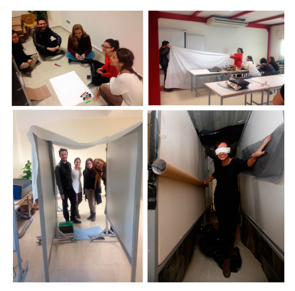
Figure 6. 'Black Tunnel'.

Therefore, the project highlighted significant architectural/interior design features of the space which we usually pass by unnoticed (Figure 8).