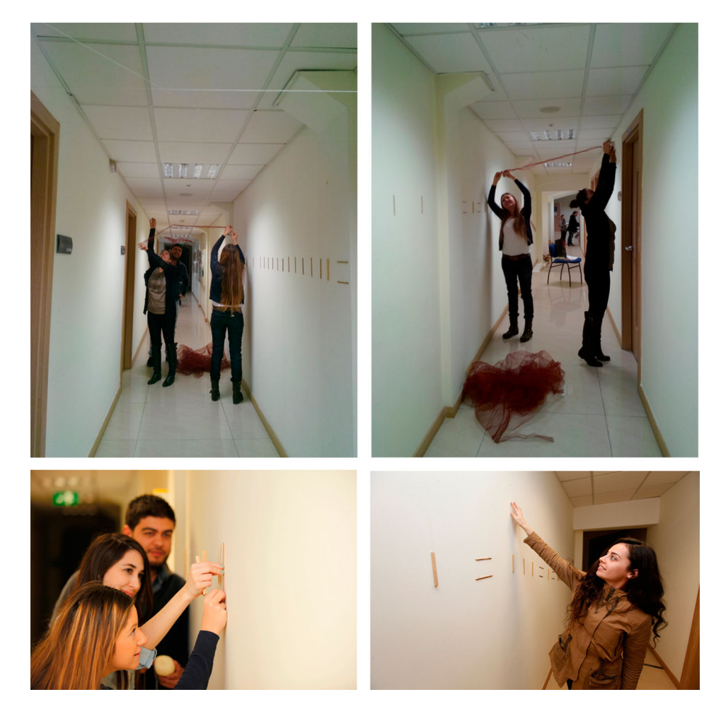
Figure 8. 'Taste of Touch' (Image courtesy of authors, 2013).

Twenty-four per cent of students (five people) noted that all products were successful in their intent and were creative and successful in meeting the basic requirements of the workshop.