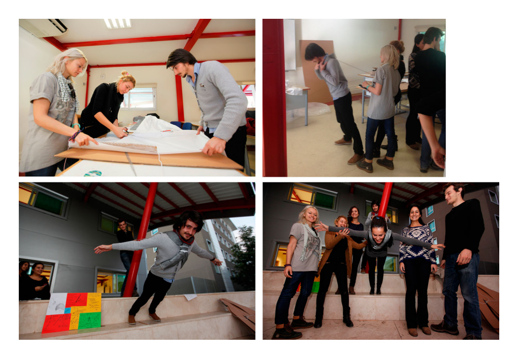
Figure 2. 'Freedom'.

The third project was called 'A Box of Experience'. This group offered different experiences to participants using 'the box'. It was constructed of cardboard shot through with thin wooden sticks, which formed a 3D labyrinth inside. The participant would try to reach the end of the box with his or her arm, passing along the sharp points of the sticks that formed the edges/contours of the interior 'void'.