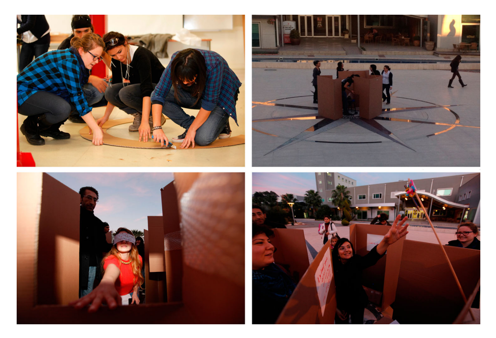
Figure 1. 'Life Circle'.

The second project was called 'Freedom'. The group introduced the idea of flying and that everybody was 'free' and equal, having similar experiences in the air. They worked to demonstrate this through simulating a flying experience utilising the existing university environment. Using a pole in the campus's amphitheatre as an anchor, the students placed two safety belts made of rope, bubble wrap and mosquito net around the body of a participant. The ends of the safety belts were kept tight around the pole by a group member while the participant leaned out from one of the stairs with arms open and eyes closed. The intention was to create a platform where everybody, regardless of their differences, could enjoy and be thrilled by the experience of diving into emptiness (Figure 2).