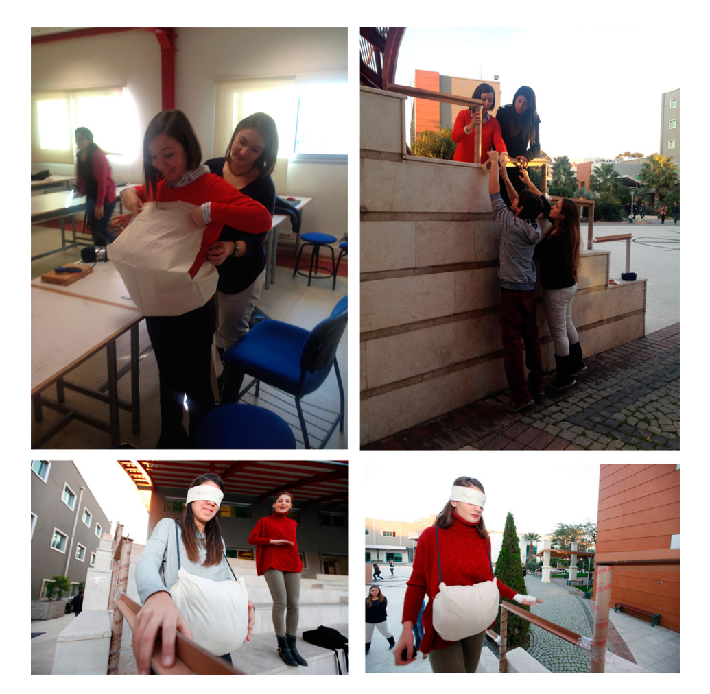
Figure 4. 'Two Birds with One Stone' (Image courtesy of authors, 2013).

The fifth project was called 'Justouch'. It focused on the sense of touch and aimed to evaluate how we would understand our physical environment if we were only able to use our sense of touch. The team set out different materials (e.g. sand, sugar, stone) on a testing table and used an attached hood to cover the