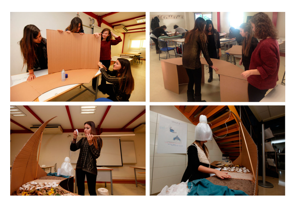
Figure 5. 'Justouch' (Image courtesy of authors, 2013).

participant's face. During testing, the participant tried to identify the material by touching it. In this project, the group emphasised the link between the touch and sight in everyday life (Figure 5).