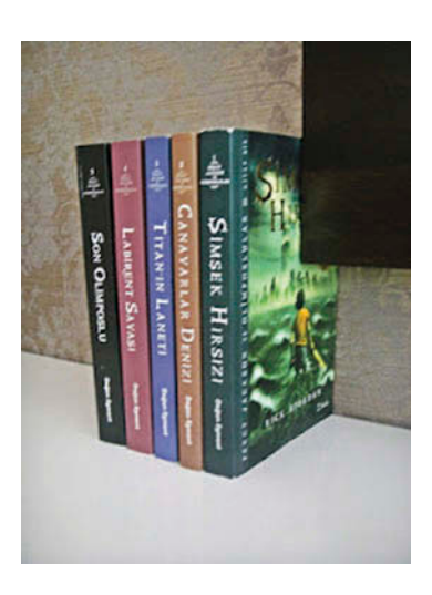
Figure 2. Labeling of series on bindings and front covers in the Turkish versions.

Secondly, all the books were marked as being a part of a series in Turkey. Each book was labeled as book 1, book 2, and so forth, respectively.