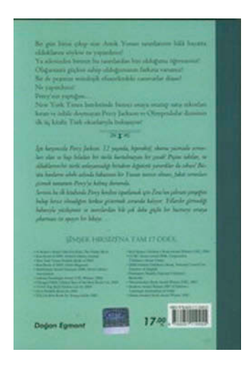
Figure 4. Back cover of Turkish version: The Lightening Thief.

The translator also concurs that in choosing the paratexts of the translations the Turkish publishing house walked a thin line in trying to address two different "buyers." On the one hand, they were trying to appeal to adult buyers, convincing them that this was not just another American teen novel, but an example of world literature for teens through the use of sombre colours and muted covers, lists of awards won by the series, a third person narrative not reflective of the style in the book, and so forth. On the other hand, the publishing house was also trying to appeal to the teen reader who would be attracted to the cover illustration of a teenager, the questions posed by the third person narrator allowing readers to empathise with the character and so on.