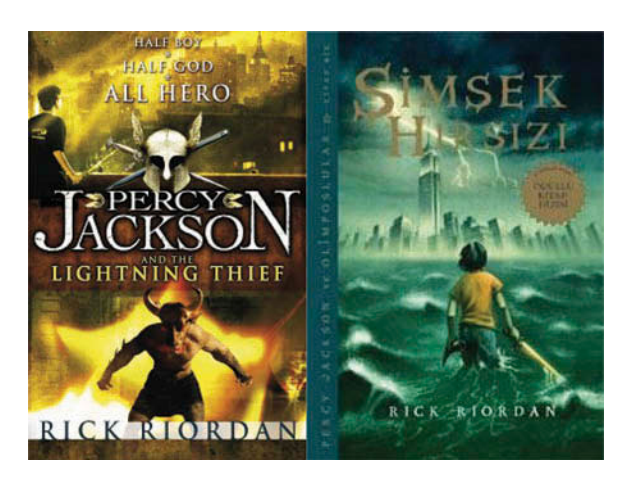
Figure 1. Comparison of covers in English and Turkish.