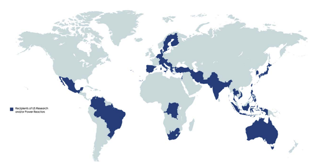
Figure 1. Recipients of US nuclear technology transfers (research and power reactors).

High-ranking members involved in the US-Romanian negotiations on atomic assistance suspected Ceausescu had adopted a nuclear hedging strategy, but continued