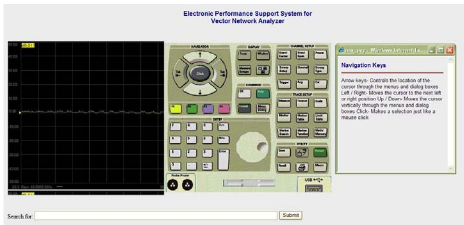
Figure 3: EPSS for ERRL (VNA Equipment)

EPSS structure of the ERRL project is developed on the pilot part of the project which is designed for Vector Network Analyzer (VNA) equipment of the laboratory. The EPSS can be reached from anywhere in the ERRL project. When the user needs something to learn about the VNA for example then clicks a link to be able to pass the EPSS part of the VNA. Figure 3 is showing the VNA help system. The real picture of the equipments is used in the user interface panel and screen. The right side is blank at the beginning. If the learner needs to learn something about the buttons then it is enough to click on the buttons to see the explanations of that button ( See Figure 3, right part ).