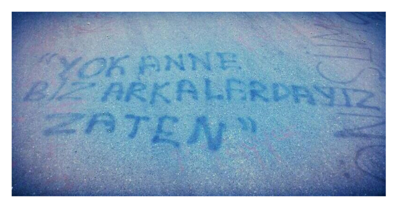
Image 5 "Don't worry Mom, we are at the back rows."

by framing them as children and denied them agency, but also reaffirmed the state's claim to the representation of interest by placing it in the position of a husband who delegates his wife to parent their children. In response to this paternalist emasculation, this time mothers themselves took to the streets and gathered at Gezi Park to create a circle around their children to protect them from the police. These women, who chose to participate in the protests by dancing, banging on pots and pans, singing, and even cooking to support their children (see Image 6), resorted to the reversal-of-the-metaphor technique to subvert the role of motherhood imposed on them by the state by accepting the role but using this authorization for its opposite purpose by becoming protestors themselves. They also subversively imitated the voice of the state to address the mothers, not of the protestors, but of the police officers attacking the demonstrators: "Dear mothers of the police," they