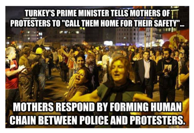
Image 6 Mothers at Gezi subversively responding to the call of the authorities to remove their children from the protests by joining their children in support of the protests. https://elfkat.wordpress.com/tag/turkey/

hailed, "please remove your children from the park."<sup>24</sup> This parodic replication of the official rhetoric not only allowed the mothers to re-empower the protestors by using their parental authority to sanction and legitimize their cause, but also to use the same technique of emasculation on the police—the epitome of masculine power—themselves, thereby exposing the fictitiousness and absurdity of the infantilization of the protestors.