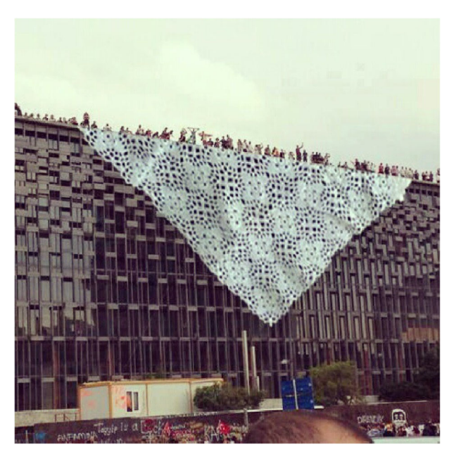
Image 8 The building with a giant lace on it is the Atatürk Cultural Center, a key landmark on Taksim Square where the Gezi protests took place. The lace is reminiscent of traditional households where laces are placed in a similar way on television sets and other furniture, making a reference to the traditional housewife image, who now has a subversive presence among the protestors. This building was later demolished by the AKP government in 2018. https://www.mothervoices.org/column/2016/3/2/february-2016-oda-projesi-tr