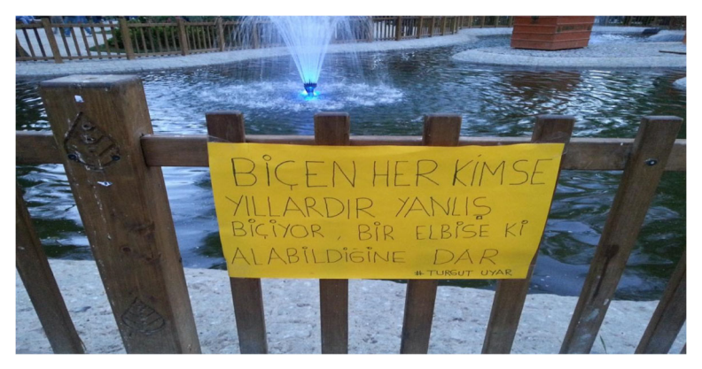
Image 9 "Whoever has been tailoring the dress for years has been doing it wrongly/ It is a dress way too tight." Turgut Uyar http://erkansaka.net/senay-cinar-hepimiz-turgut-uyarin-dizeleriyiz/