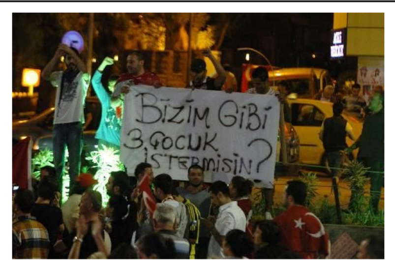
Image 4 "Would you like 3 children like us?" (http://duvardageziparki.tumblr.com/page/15)

by framing them as children and denied them agency, but also reaffirmed the state's claim to the representation of interest by placing it in the position of a husband who delegates his wife to parent their children. In response to this paternalist emasculation, this time mothers themselves took to the streets and gathered at Gezi Park to create a circle around their children to protect them from the police. These women, who chose to participate in the protests by dancing, banging on pots and pans, singing, and even cooking to support their children (see Image 6), resorted to the reversal-of-the-metaphor technique to subvert the role of motherhood imposed on them by the state by accepting the role but using this authorization for its opposite purpose by becoming protestors themselves. They also subversively imitated the voice of the state to address the mothers, not of the protestors, but of the police officers attacking the demonstrators: "Dear mothers of the police," they