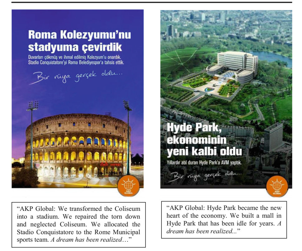
Image 2 Mock AKP campaign posters circulating in the social media during Gezi that illustrate the remedial interventionism of the AKP, and the non-political, no-agenda, cosmopolitan approach to protest. "Sosyal medyada 'AKP dünyayı yönetseydi ne olurdu' esprisi. [Social Media Humor: 'What would happen if the AKP ruled the world']" t24.com.tr, July 12, 2013. http://t24.com.tr/galeri/akp-dunyayi-yonetirse/3965

("jamiryo") to various internationally famous soccer players, and use of English phrases and words intentionally misspelled and combined with Turkish words as a display of the globality of the main motives of the demonstrations (see Image 3). Humor was the common element that brought together diverse forms of expression, which not only allowed people and groups with very different backgrounds and political opinions to come together, but also boosted the countrywide and global popularity of the protests.