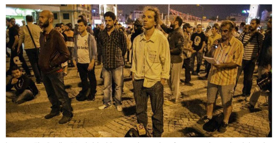
Image 12 The Standing Man is joined by a growing number of protestors who stood as independent individuals but protesting collectively. https://t24.com.tr/haber/13-kose-yazarindan-duran-adam-yorumlari,232308