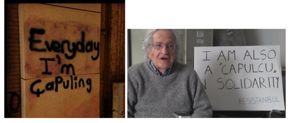
Image 3 "Everyday I'm Çapuling" became one of the most popular slogans of the protests. Among many others, Noam Chomsky also adopted the word "Çapulcu" to show support for the Gezi protests. (https://en. wikipedia.org/wiki/Chapulling); http://bianet.org/bianet/insan-haklari/147248-chomsky-de-capulcu