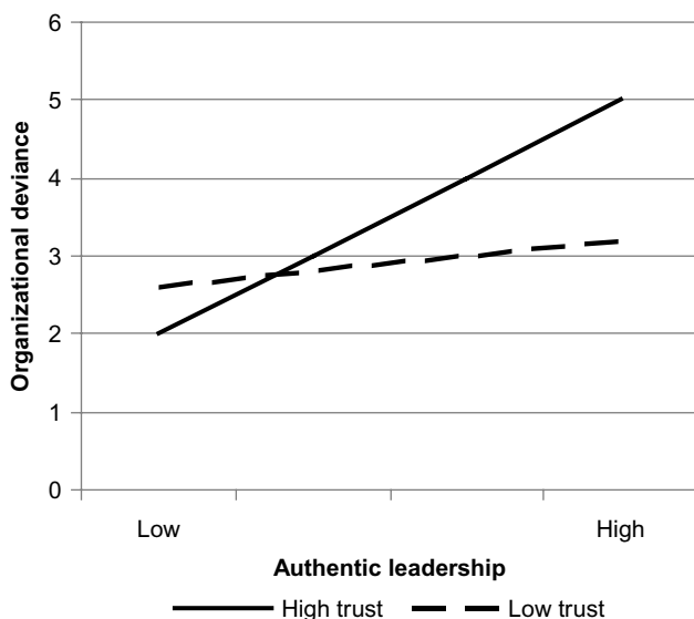
Figure 1. Interactive effects of authentic leadership and trust on organizational deviance