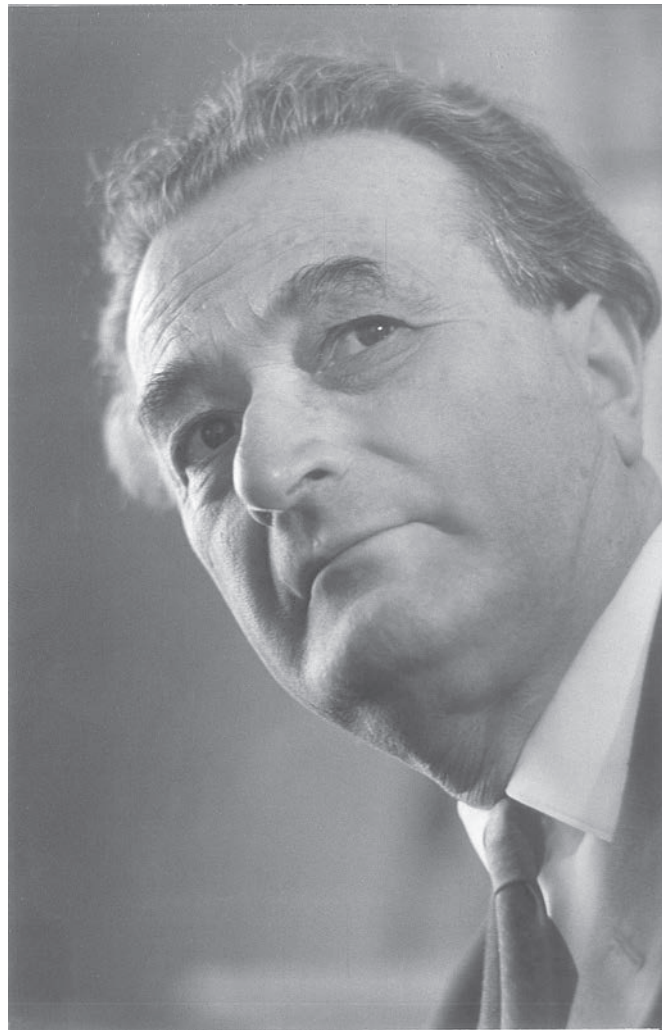
Pictured above: Ahmed Adnan Saygun.

Throughout the nineteenth and early twentieth centuries, the Ottoman Empire was experiencing a vast transformation at all levels—social, political, and cultural. An empire that straddled two continents was beginning to align itself more closely with Europe and the West. The preferences and outlook of Ottoman court music shifted from the long tradition of heterophony to more complex polyphony influenced by visiting European performers and composers. Ottoman court musicians were recruited to play in European-style bands with the help of Italian, Giuseppe Donizetti, brother of famous opera composer, Gaetano Donizetti. 1 For a long time, Italian opera and military band music dominated the scene. It wasn't until the establishment of the Turkish Republic in 1923 that music really began to be created by the country's own composers.