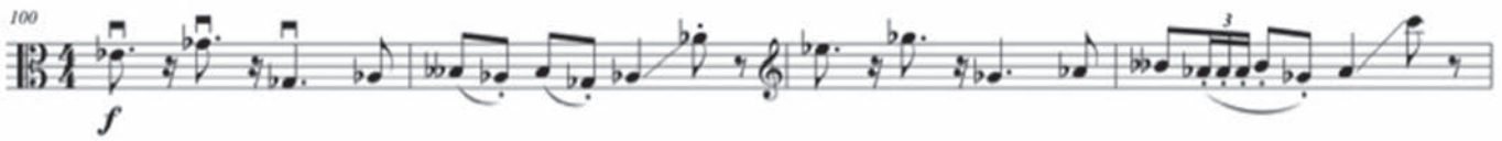
Example 10. Saygun, Viola Concerto , movt. 3 , mm. 100-103

The solo viola cadenza begins the third movement, which is a combination of Turkish and Balkan folk tunes (see Ex. 9). Lyrical in nature, the tied-over triplets and sixteenths emphasize a flexible pulsation. Later on in the movement, another folk dance called the ağır zeybek (slow dance) is introduced by the solo viola in m. 100 with heavy down bow strokes and glissandi (see Ex. 10). The ağır zeybek , a dance that is synonymous with courage and dignity, is indigenous to the Aegean region of Turkey and is most commonly danced by men. The meter is typically in an \frac{18}{4} or \frac{9}{4} , rarely in a \frac{4}{4} meter, which Saygun employs. The viola imitates the zurna , one of the two instruments which normally provides the music for an ağır zeybek . The zurna is a double reed instrument that resembles a medieval shawm, predecessor of oboe with a larger bell. The second instrument is the davul , which is a large drum played with a padded mallet at the musician's waist. Saygun recalls Bartók's first experience hearing the davul and zurna on their folk music expedition, "the musicians began to play and something strange resulted; the blows that the old fellow gave to his [ davul ] made the whole building shake[...] The piercing cry of the zurna made the air of the room most vibrant, producing a deafening and bizarre roar." 26