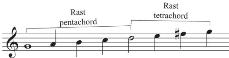
Example 1. Makam tetrachord and pentachord combinations that Saygun uses throughout the Viola Concerto . 14

working, (because) it is my only consolation”, and “I realize very much that the solitary life suits me [...] after the fourth symphony, I wrote a trio for oboe, clarinet, and piano [op. 55], the Lamentations-Book II for tenor solo and male chorus [op. 54], and a Ritual Dance for orchestra [op. 57]. I continue my studies on traditional Turkish music.” 15 Soon after completing these pieces, he began writing the Viola Concerto . By that time, he was familiar with composing in the Concerto form, having already written Piano Concerto No. 1 , op. 34 (1957-1958) and Violin Concerto , op. 44 (1967).