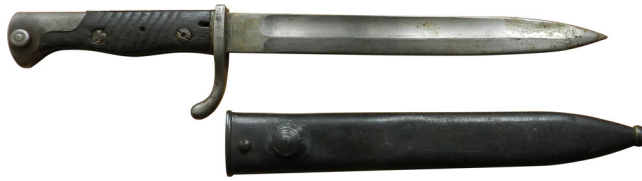
FIGURE 9. A 'Turked' Waffenfabrik Mauser S.98/05 and scabbard (author's photograph).

treaty coming into force any excess weaponry and munitions were to be surrendered to a Military Inter-Allied Commission of Control for this reason under Article 200 of the treaty. These articles, in other words, matched closely the disarmament of Germany as set out in Part V of the Treaty of Versailles.