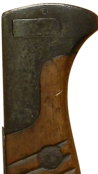
FIGURE 4. The fraktur mark on the pommel of a Waffenfabrik Mauser S.98/05.