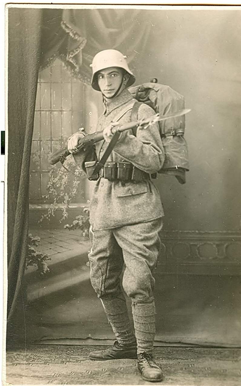
FIGURE 8. A posed photograph of a Turkish soldier en garde with a rifle and fixed S.98/05, dated on the back November 1931 (author's collection).

August, 1920, on the other hand, stipulated in its Articles 171 and 172 the quantities and types of weaponry that could be held in the future by the Turkish armed forces, including the necessary reserve stocks and the weaponry allotted to the Gendarmerie, the rural police force. Article 173 specified further that within six months of the