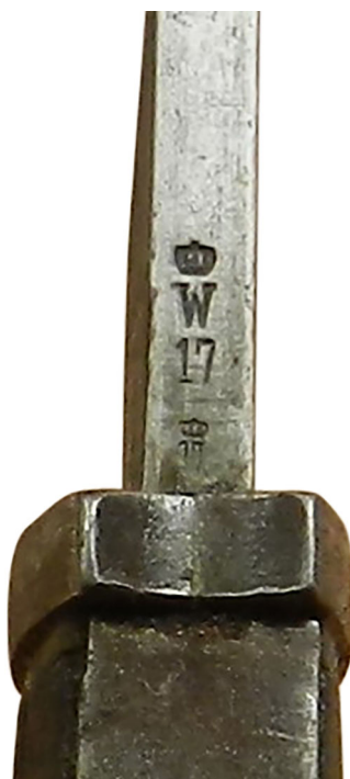
FIGURE 3. The Abnahmestempel on the blade-back of a Waffenfabrik Mauser S.98/05 made in 1917.

acceptance marks indicating inspection and acceptance for service by the duly-appointed inspectors (Figure 3). These consisted of a crown over a 'W', for Wilhelm II, King of Prussia and Kaiser of the Deutsches Reich ; below this the last two numbers of the year the bayonet was approved for issue; and then a smaller crowned 'Gothic' letter, the so-called fraktur or inspector's mark, representing the initial letter of the inspector's surname, which in the case of the WFM bayonets was a 'W'. This fraktur was applied after the blade had been tested and approved for further work, one or two examples of the same mark being found on the left-hand side of theommel above the rifle catch system (Figure 4), to denote other stages in the inspection process.