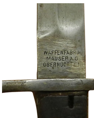
FIGURE 5. A typical maker's mark on the ricasso of a Waffenfabrik Mauser S.98/05.