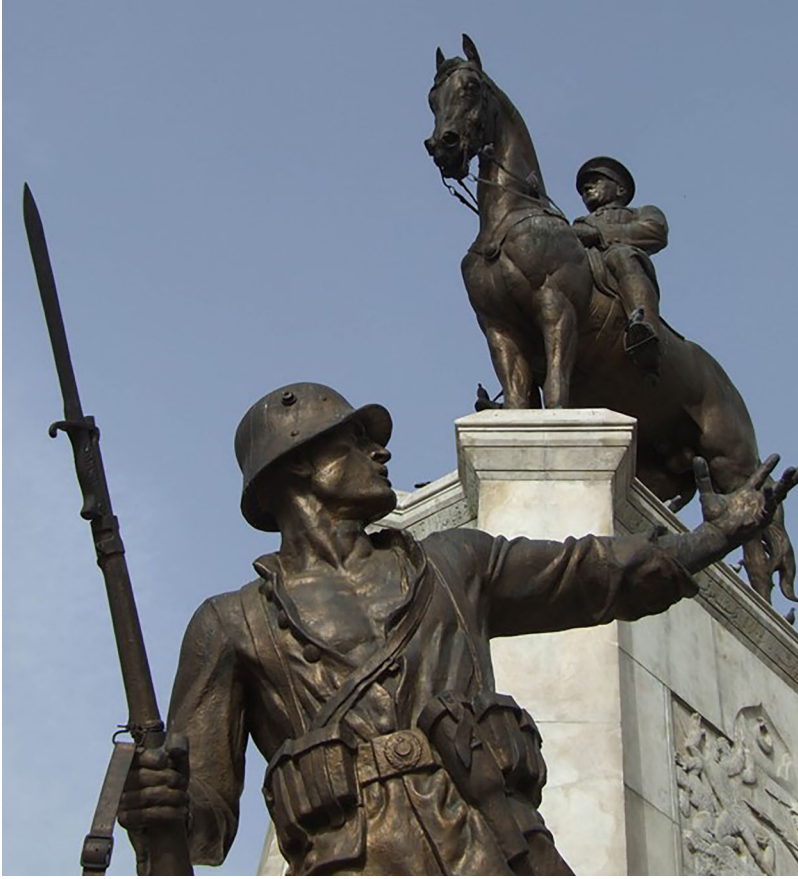
FIGURE 7. One of the soldiers shown on the statue group made by H. Krippel and erected in 1927 in Hakimiyet-i Milliye Meydanı (“Sovereignty of the Nation Square”), Ankara, holding a rifle with a fixed S.98/05.

though, these weapons had been made available to somewhat less than a quarter of the Ottoman Army at its peak strength of around 700,000. Whether they had arrived in too few numbers and too late to save an increasingly demoralised army is an unanswerable question. All that can be said for certain, is that in theory there were enough around to arm each of the mere 100,000 men that constituted the Ottoman Army when the Armistice of Mudros was agreed on 30 th October 1918. 48 Many of the spares presumably slipped away into private hands, probably with their bayonets also, as examples of the WFM S.98/05 are seen often in the ‘antika’ shops and bazaars of modern Turkey. 49