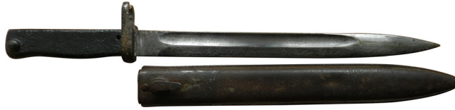
FIGURE 1. An 'Ersatz' bayonet, type EB 7 bis, as supplied to Turkey in 1916.

on the side of the Central Powers, opening up a direct transfer route from Germany and the Austro-Hungarian Empire to Constantinople. By January 1916, Germany was supplying the Ottoman Empire with WFM rifles captured from Belgium during the invasion of 1914 and Mosin-Nagant rifles taken from the Russians after the victories at Tannenberg and elsewhere on the Eastern front. 11 Even so, as a British Military Intelligence report on the Ottoman Army for 1916 noted, it was seriously under-armed in terms of modern infantry weaponry. Although it states there were 500,000 WFM Models 1890, 1893 and 1903 rifles currently in service with the Sultan's armed forces, there was also a wide variety of other obsolescent types in use. These included 200,000 WFM Model 1887, about 500,000 'Martini-Henry [and] Martini-Peabody rifles', of which 370,000 were probably Peabody-Martini rifles converted to fire the WFM 7.65 mm cartridge, the others presumably Constantinople-made clones of the Martini-Henry of a 9.5 mm calibre, and 'considerable numbers of Remingtons and Winchester repeating rifles', black powder weapons in equally obsolete calibres that Ottoman Turkey had imported in the 1870s and 1880s. 12