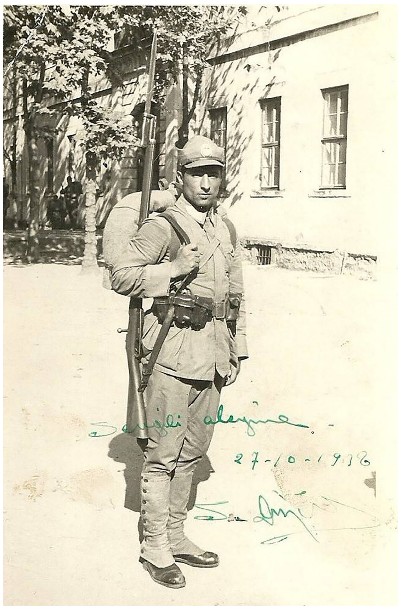
FIGURE 10. A posed photograph of a Turkish soldier with a rifle and full-length 'Ersatz' bayonet, dated on the front 27th October 1936.

1950, Turkey's 'forgotten war', that the Turkish Armed Forces began to replace their bolt-action 'Turkish Mausers' with a more modern rifle, the 'Garand' M1 as then used by the army of the United States of America. 54