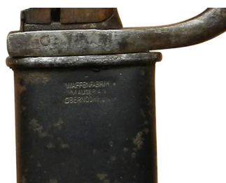
FIGURE 6. A typical maker's mark on the scabbard for a Waffenfabrik Mauser S.98/05.